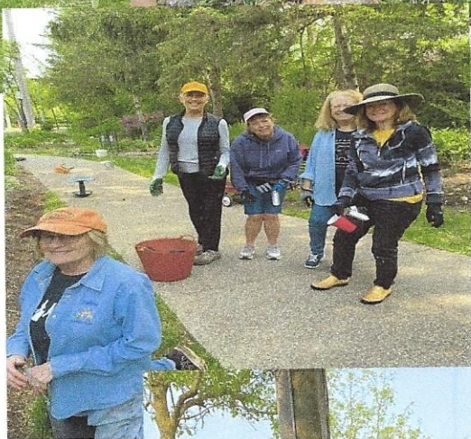
Great job Ladies